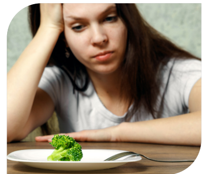
February: Eating Disorders