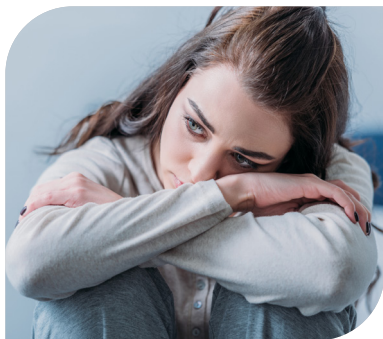
October: Anxiety & Depression

In response to skyrocketing rates of mental health challenges facing girls and young women in the Jewish community, Gateways is convening a series of experts to speak directly to parents and educators on how to identify early warning signs of girls' mental health issues and share strategies to support girls who are struggling. All webinar presentations are free and require pre-registration. In the week following each webinar, Gateways will convene a discussion (via Zoom) facilitated by a clinical psychologist to share additional resources and to address specific concerns and questions.